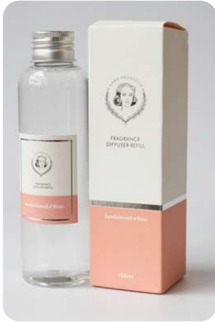
Sandalwood and Rose