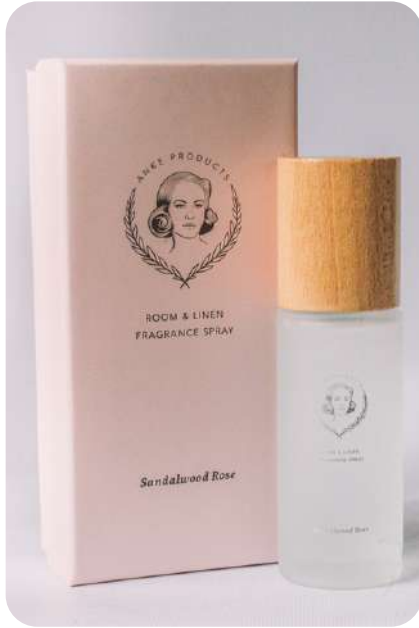
Sandalwood and Rose