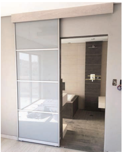
Double sided decor glass sliding door

Fineline mirror doors create spacious, lighter, brighter bedrooms. Wide opening, swish sliding door panels have transformed bedrooms and earned world-wide approval. With complete safety, sliding door panels gain as much as 25% more storage space while saving on floor space.