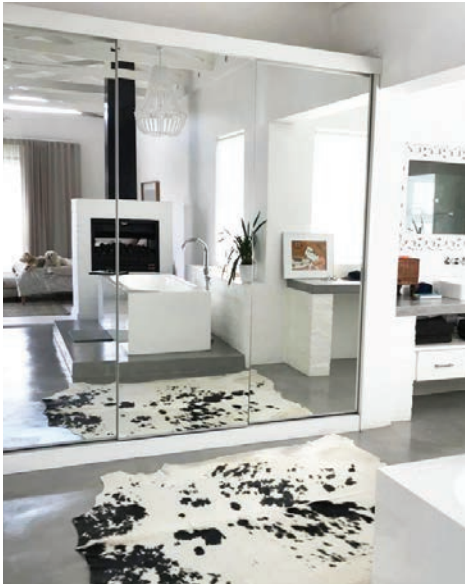
Frameless mirror sliding doors