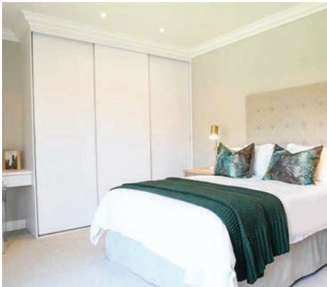
Melamine sliding doors