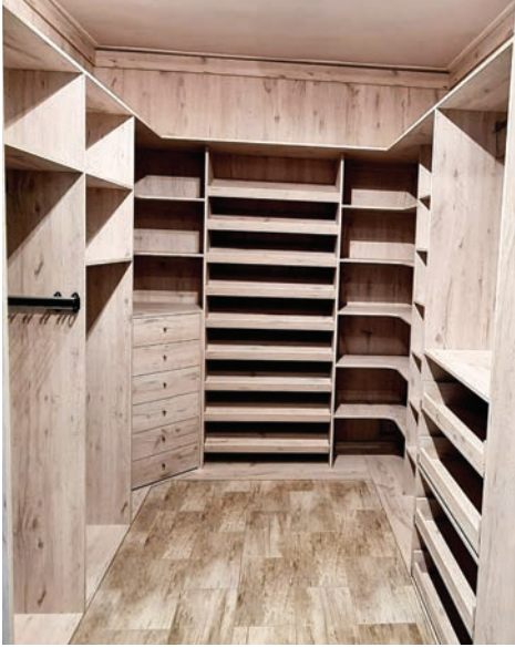
Woodgrain internals of walk-in wardrobe