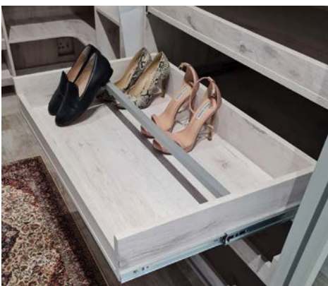
Pull out shoe drawer