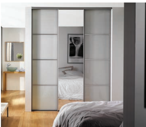
Combination mirror and decor glass sliding doors