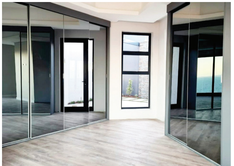
Frameless grey tinted mirror sliding doors