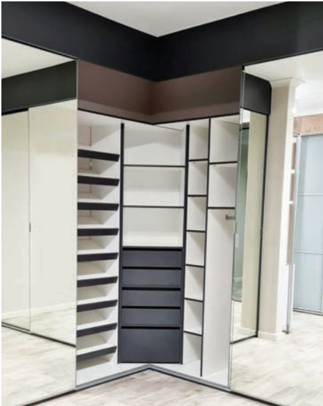
Internals of L shaped wardrobe