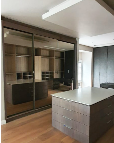
Frameless grey tinted mirror sliding doors and island