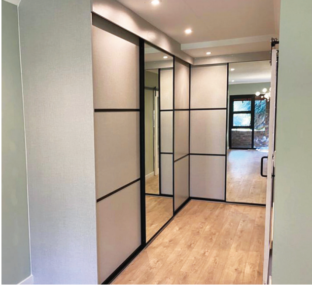
Combination Metro melamine and mirror sliding doors →