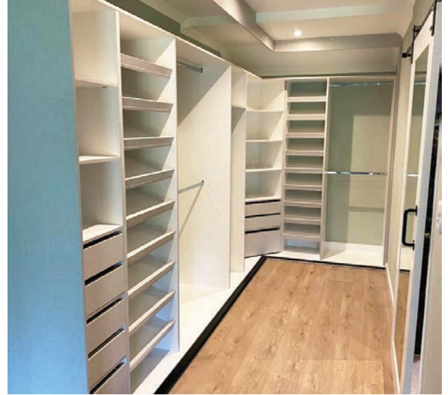
White melamine internals with no doors (of wardrobe on left)