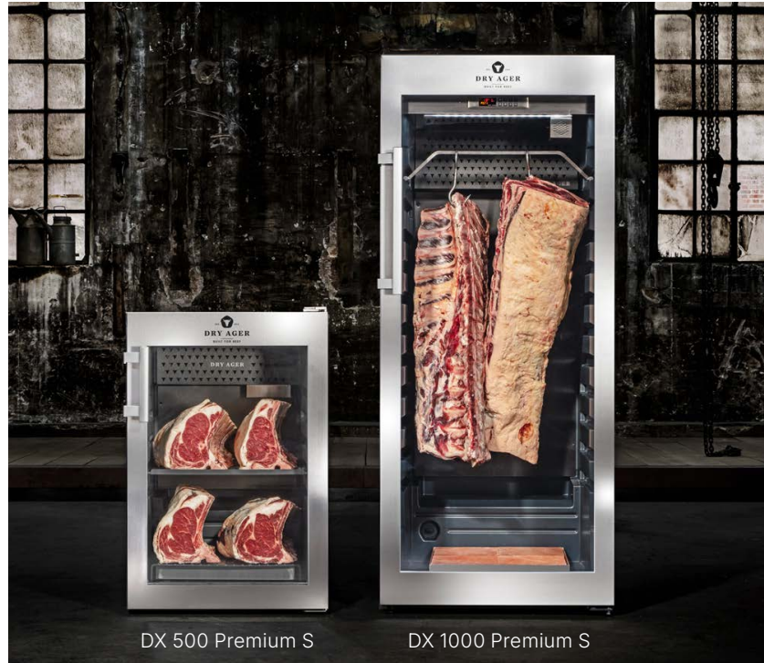
DX 500 Premium S