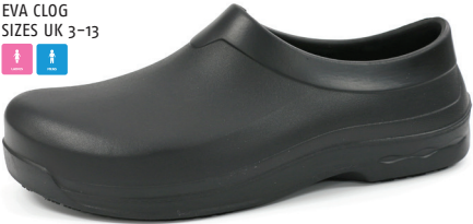
VERVE EVA CLOG SIZES UK 3-13