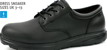
JONES DRESS SNEAKER SIZES UK 3-13