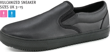
ECLIPSE VULCANIZED SNEAKER SIZES UK 3-15