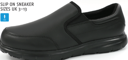
SMITH SLIP ON SNEAKER SIZES UK 3-13