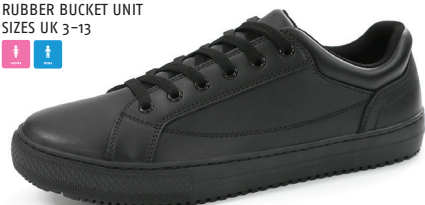
RAVEN RUBBER BUCKET UNIT SIZES UK 3-13