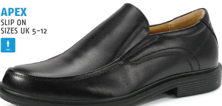
APEX SLIP ON SIZES UK 5-12