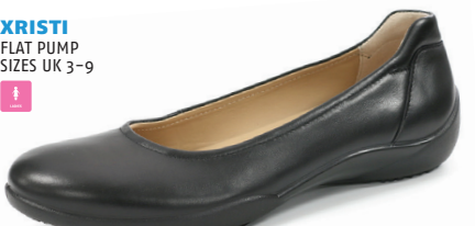
XRISTI FLAT PUMP SIZES UK 3-9