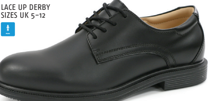
VENTURE LACE UP DERBY SIZES UK 5-12