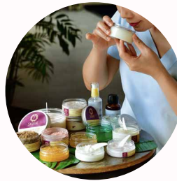
PROFESSIONAL SPA PRODUCTS & TRAINING SERVICES