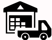
Storage & Distribution