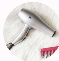
APPLIANCES & EQUIPMENT