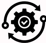
Production & Filling