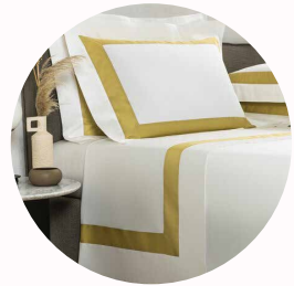
BEDDING & LINEN