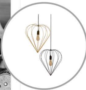
ABBI HEART PENDANT