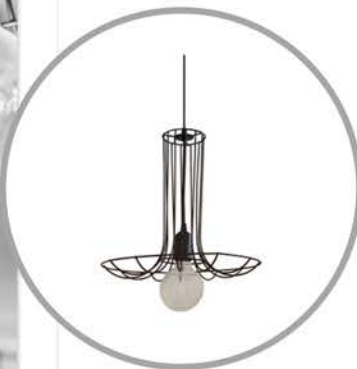
JOES WIRE PENDANT