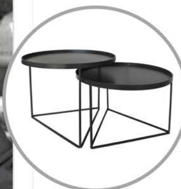
LAUREL & HARDY NESTING TABLES