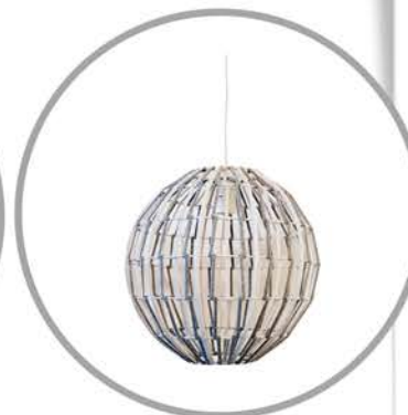
T-YARN BALL PENDANT