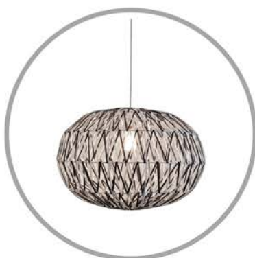
T-YARN EGG PENDANT