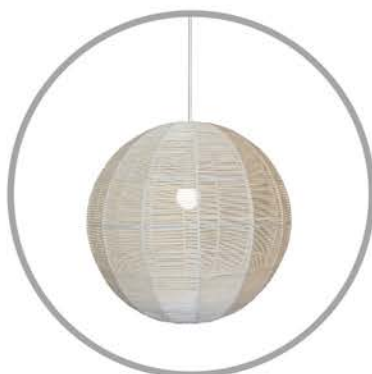
ROPE YARN PENDANT