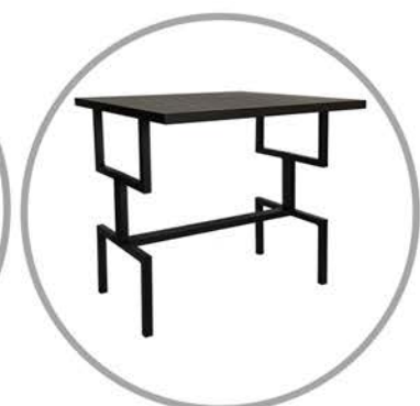
JERRY SIDE TABLE