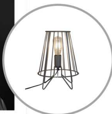
FLUKE TABLE LAMP