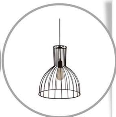
CALABASH WIRE PENDANT