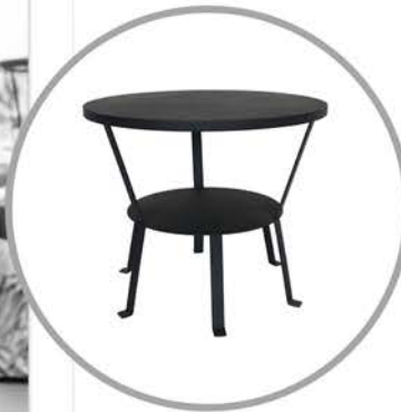
TRI-MAX SIDE TABLE